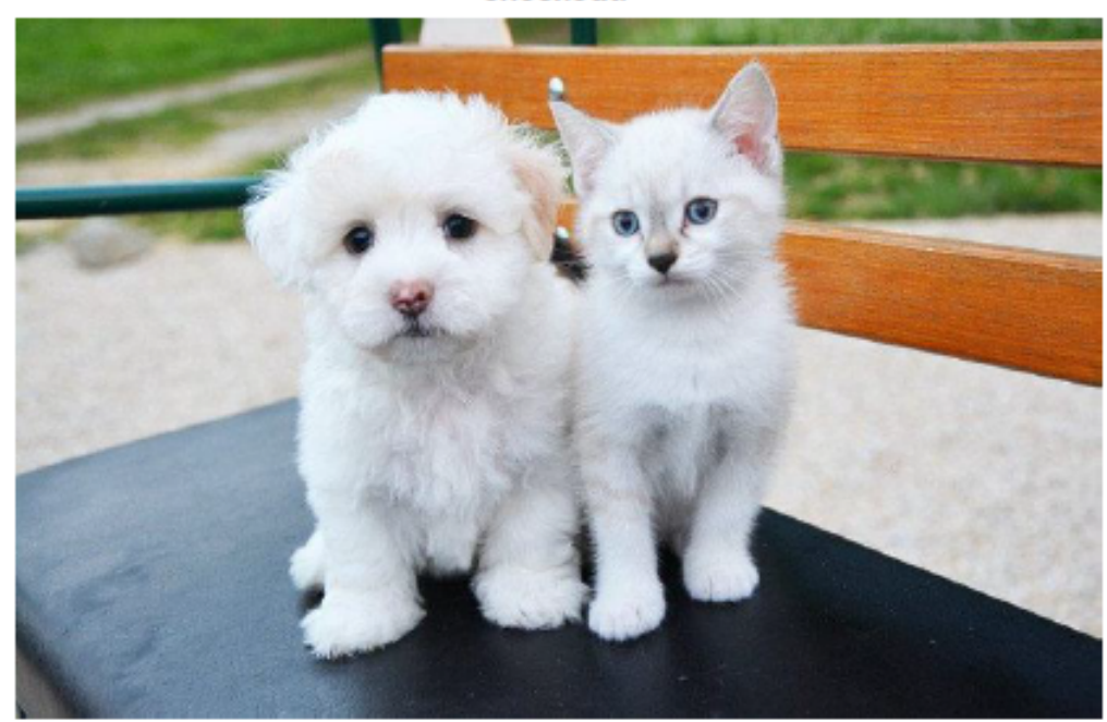
Like us on Facebook @EyeEnvyAustralia

As always free shipping for all orders over $50. Plus we now offer a special 10% discount for orders over $250, add code: 10for250 at checkout.