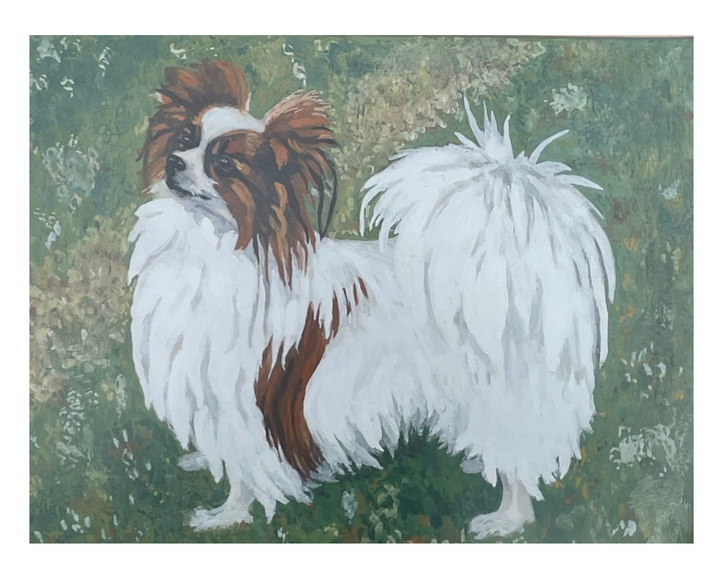
Aust. Ch. UK. Ch. Thingden Riesling.

This lovely painting of Aust. Ch. UK Ch. Thingden Reisling is displayed in the Canine Museum at KCC Park Westernport Hwy Skye. Our thanks to the Canine Museum for allowing the club to use this image.