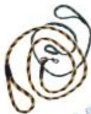
Slip and Clip Rope Leads