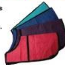
Cool Coats made with chamois and come in 12 different sizes.

Our fabulous hand-made warm coats are made with double layered polar fleece for extra warmth & snugness. There are 2 varieties (Vest with a zip and the Reversible without a zip) They come in 20 different sizes from Extra Small to Extra Extra Large 2. Should your lovely puppy dog not be a standard size, you can place an order online for a coat to be made to size.