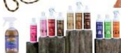
Grooming Products including Plush Puppy & Petway.