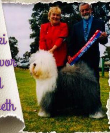
Grand Ch Fitzwilly Wine n Roses