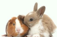
Rabbits Guinea Pigs